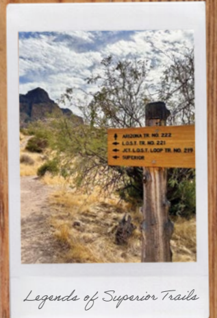
Legends of Superior Trails