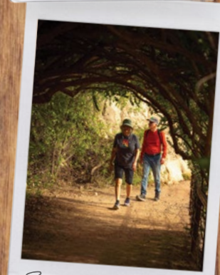
Boyce Thompson Arboretum