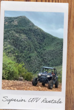
Superior UTV Rentals