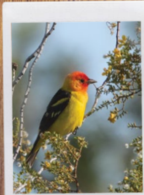
World Class Birding